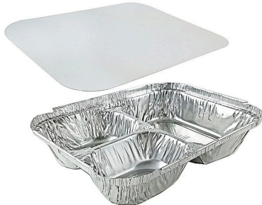
Handi-Foil™ 3 Compartment Foil Pan with Board Lid