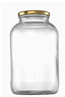
Recyclable Glass Containers