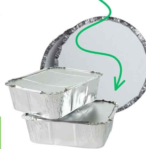
Aluminum Take-Out Food Containers