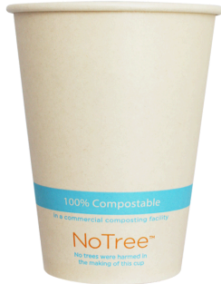
World Centric® NoTree® Paper Cup