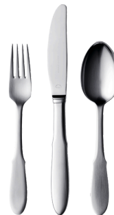
Reusable Metal Cutlery