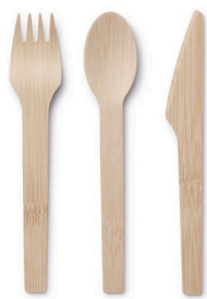
Bambu® Disposable Bamboo Cutlery