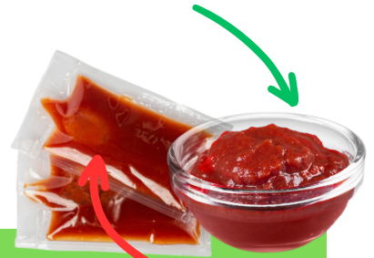
Reusable Glass Saucer

Single-use or disposable foodware refers to items associated with food and beverages designed for serving or transporting prepared food that are meant to be thrown away after a single use, or a limited number of uses.