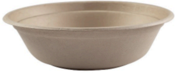
PrimeWare® Molded Fiber Bowls