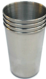
Stainless Steel Dishware