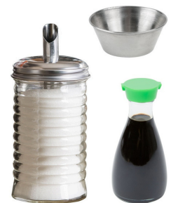
Reusable Condiment Containers