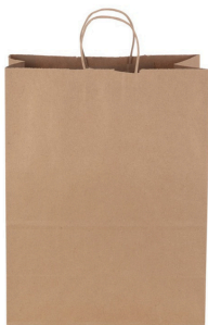
Dubl Life® Recycled Paper Shopping Bags