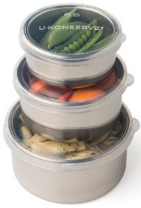
Reusable Takeaway Containers