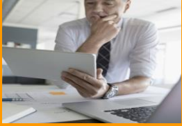
ACTIVITIES AND EVENTS