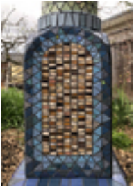
Elements in Separation (detail) mosaic 74" x 16" x 16" $9000.00 2020