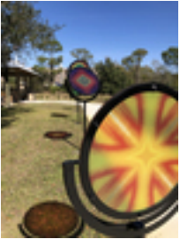
Magnify Plasma Cut Steel, CNC cut 1/2" polycarbonate, UV inks 7' x 3' x 2" $30000.00 2021