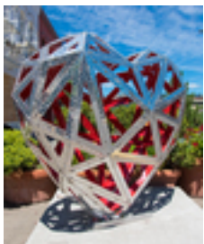
Low-Poly Open Heart (RIDE) Hydro-Cut Welded Aluminum Diamondplate, Tractor Paint 5' x 5' x 2.5' $18000.00 2017