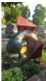
Wave glass mosaic over cast concrete 43" x 46" x 32" $30000.00 2017