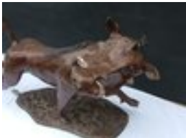
Day on the serengeti Bronze 32" x 102" x 20" $16000.00 2016