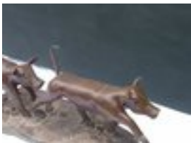
Day on the serengeti Bronze 32" x 102" x 20" $16000.00 2016