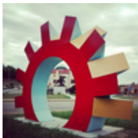
Sunrise/Sunset (Sawblade) Welded Laser-Cut Stainless Steel, Enamel 5.5" x 8" x 18" $22000.00 2018