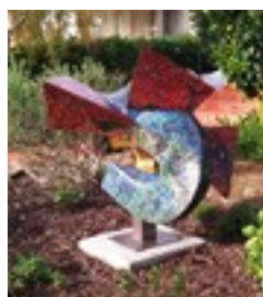
Wave Glass mosaic over concrete 43" x 46" x 32" $30000.00 2017