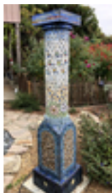
Elements in Separation (alternate view) mosaic 74" x 16" x 16" $9000.00 2020