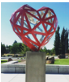
LowPoly Heart No.4 (Red) Aluminum Diamondplate, low-VOC Enamel 5" x 5" x 2.5" $9000.00 2016