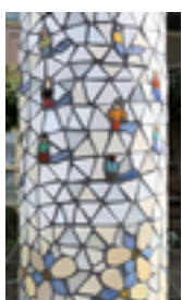
Elements in Separation (detail) mosaic 74" x 16" x 16" $9000.00 2020