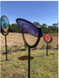
Magnify Plasma Cut Steel, CNC cut 1/2" polycarbonate, UV inks 9' x 3" x 2" $30000.00 2021