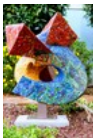
Wave Glass mosaic over concrete 43" x 46" x 32" $30000.00 2017

For the past few years, I have been working on a sculpture series that is based on the supposition "what if there was a culture in the distant past or future that we can only access through recreations of their art?" With this notion in mind, I have created several "artifacts" and "fragments" that exist in the present but also in another possible time and place. In many ways, "Wave" is an artifact from a possible, distant time, re-created as an artistic vision.