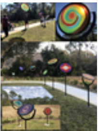
Magnify Plasma Cut Steel, CNC cut 1/2" polycarbonate, UV inks 7' x 3' x 2" $7500.00 2021