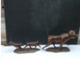
Day on the serengeti Bronze 32" x 102" x 20" $16000.00 2016