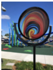
Magnify Plasma Cut Steel, CNC cut Polycarbonate, UV inks 7' x 3' x 2" $7500.00 2021