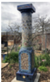
Elements in Separation mosaic 72" x 16" x 16" $9000.00 2020