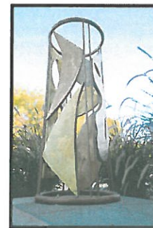
5 African Tree by Rick WaltonsSmith www.waltonsmith- sculpture.com