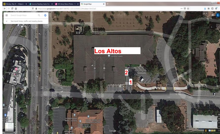
Possible Drop Box Locations

Looking at the current layout of the Main library property, there are a few possible locations for placing the drop off boxes as indicated below.