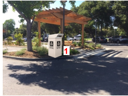
Drop Box in location #1