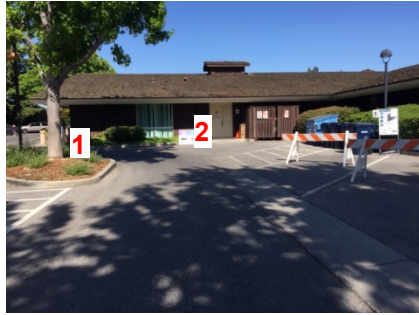
Possible Drop Box Locations