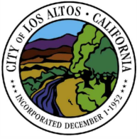
EXHIBIT B ANNUAL STREET RESURFACING PROJECT TS0100120