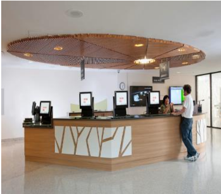
Gilroy The Lew Edwards Group