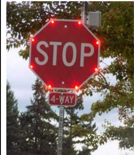
FLASHING STOP SIGN

Location 1: Los Altos Ave and West Portola Ave